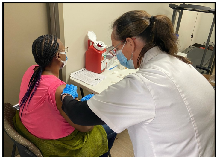
Walgreens Flu Shot Clinic