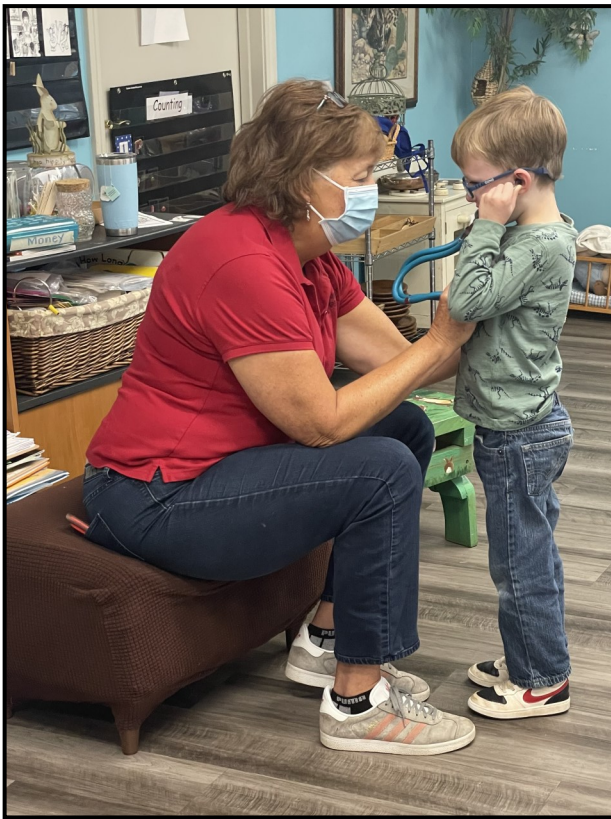
Salisbury Academy JK & K Giving Party