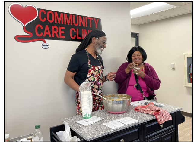
Healthy Cooking Demo